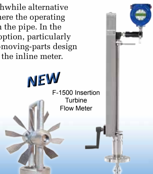
F-1500 Insertion Turbine Flow Meter

ONICON insertion turbine flow meters for steam offer the advantage of flexibility in selecting the operating range of the meter. They can be particularly useful for measuring flow in larger line sizes where flow rates are too low to use insertion vortex meters. In these applications, the pitch of the turbine rotor can be selected to better match the operating range of the meter to the expected flow rates.