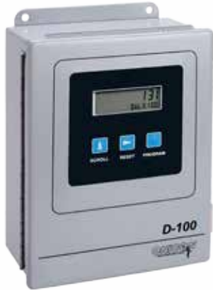
D-100 Display Module

ONICON displays offer a simple, cost-effective way to turn any flow meter into a complete flow measurement station. Display options range from the simple wall mounted D-1200 series for rate and/or total to sophisticated network interface options like the D-100.