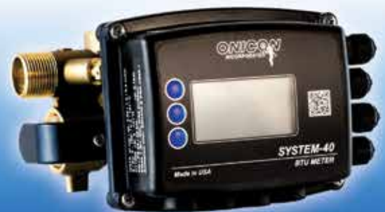
System-40 BTU Meter

Engineered performance . . . Sensibly priced