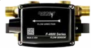
F-4600 Inline Ultrasonic Flow Meter