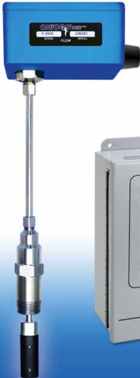
F-3500 Electromagnetic Flow Meter

Chilled Water • Hot Water • Domestic Water • Steam • Natural Gas