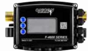
F-4600-BAC Series Inline Flow Meter