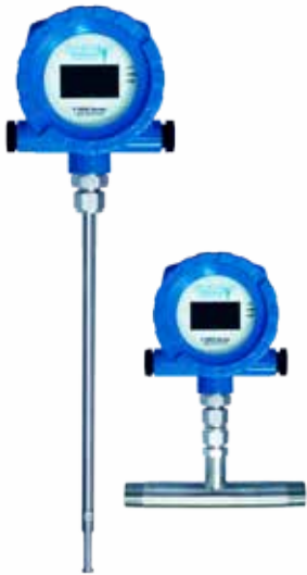
F-5100 Insertion and Inline Thermal Mass Flow Meters

ONICON thermal mass meters utilize a proprietary hybrid analog-digital sensing circuit that requires less thermal energy to operate. It is very stable and yet highly responsive to changes in flow. This allows us to accurately measure flow over a very wide operating range (over 1000:1 for the inline version) and makes our meters ideal for measuring low flow rates.