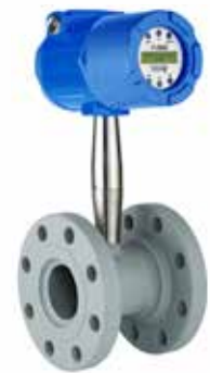
F-2600 Inline Vortex Mass Flow Meter