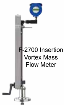
F-2700 Insertion Vortex Mass Flow Meter

ONICON insertion vortex flow meters can be a worthwhile alternative to the inline version of the meter in applications where the operating range of the meter matches the expected flow rate in the pipe. In the right application, this meter can be a cost-effective option, particularly in larger line sizes and retrofit installations. The no-moving-parts design is reliable and the accuracy is comparable to that of the inline meter.