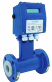
F-3100 Inline Electromagnetic Flow Meter