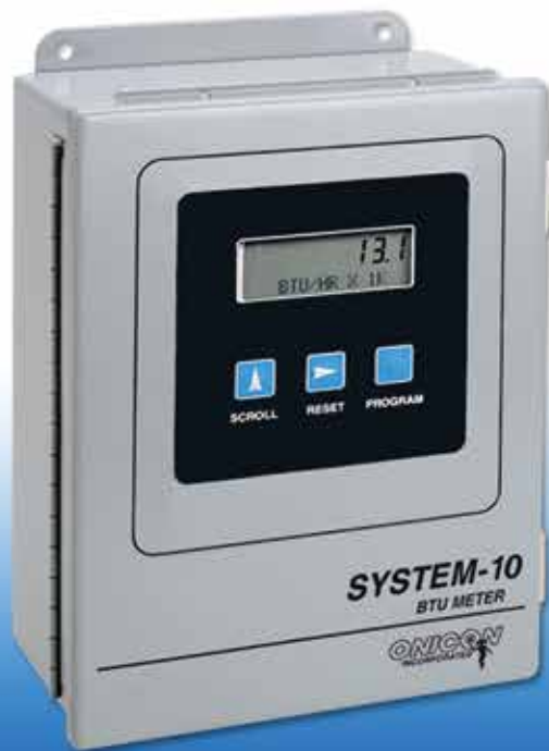
System-10 BTU Meter