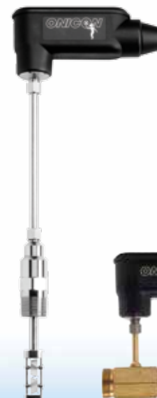
F-1200 Dual Turbine Insertion Flow Meter