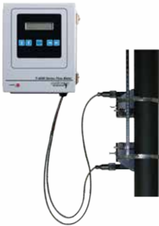
F-4200 Clamp-on Ultrasonic Flow Meter