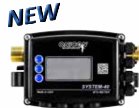
System-40 BTU Measurement System