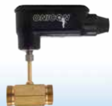
F-1300 Inline Turbine Flow Meter