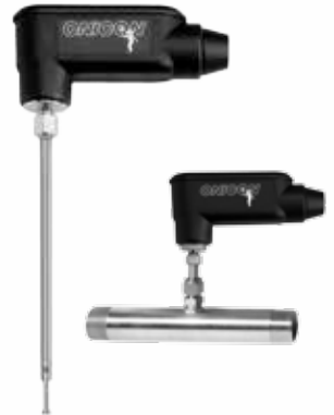
F-5200 Insertion and Inline Thermal Mass Flow Meters