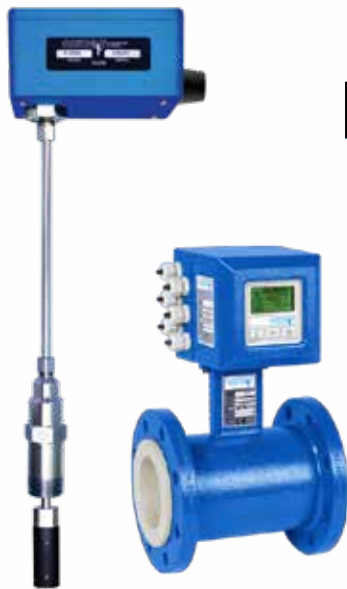
F-3500 Insertion Electromagnetic Flow Meter